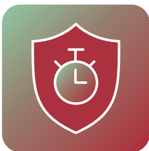
TWO MINUTES FOR MY SAFETY