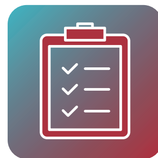
STANDARD OPERATING PROCEDURES