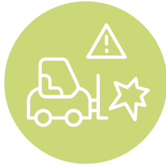
LINE OF FIRE