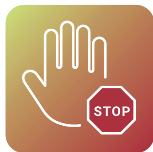
STOP WORK AUTHORITY